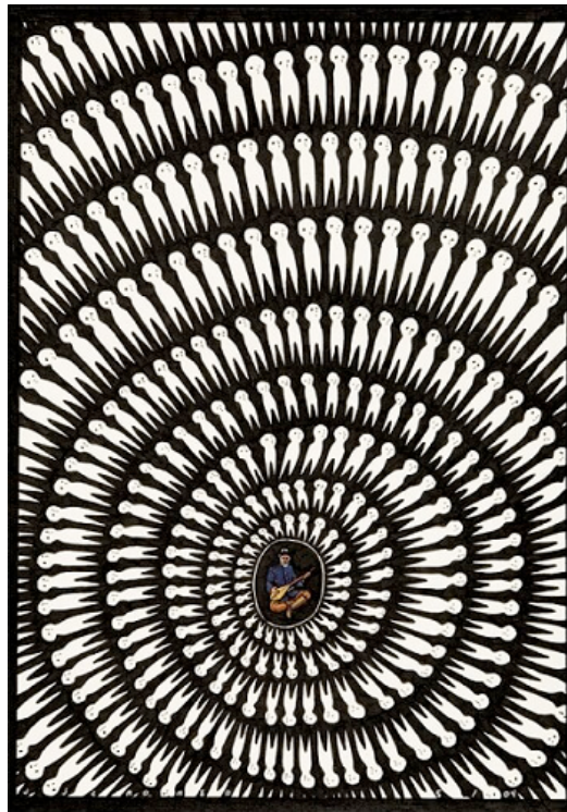
Picnic II, 10.125" x7.125", Mixed Media on Paper, 2004.