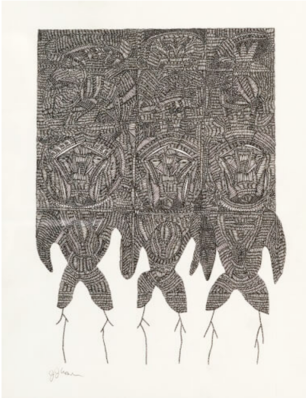
Bullies on Parade, 11.5" x 9", Ink on Paper, 2001.

"I was drawing and doodling not with any clear idea of becoming an artist," Cromer says.