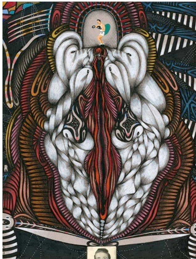
A Hawk and a Dove, 11.5" x 8" , Mixed Media on Paper, 2015.